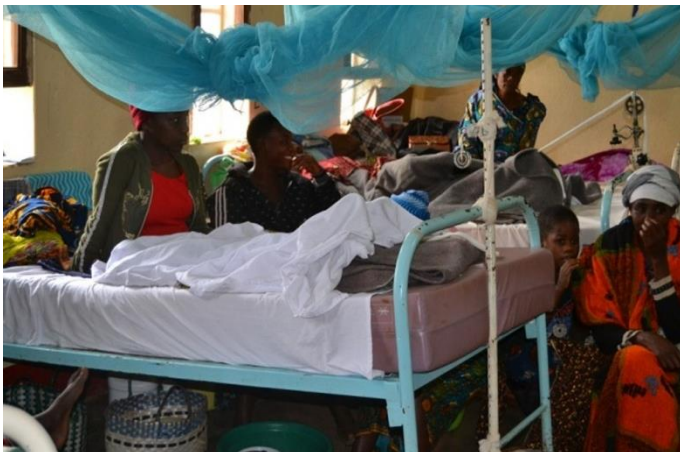
The children are admitted in these surroundings. saved the other amputated.

The new section of the Heri Village Hospital is estimated at a cost of 155.411 €, financed by the NSR Grant.