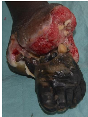
3-year old girl with gangrene in both feet. One foot