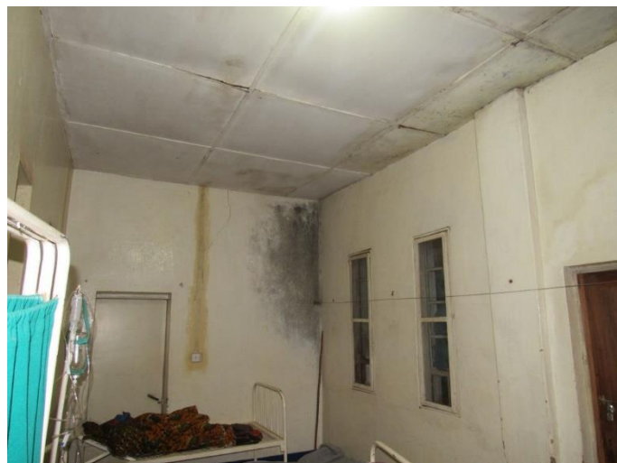
It can only be better than this.

The main hospital building was constructed in 1946 and has belong delapidated over time. Over the years attempts were made at expanding the hospital by adding walls/sections to the existing single structure.