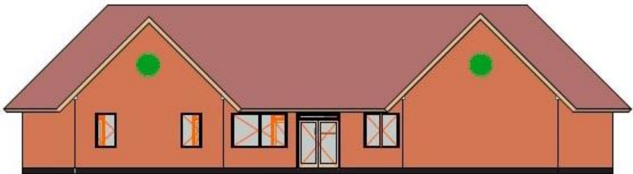
FRONT SIDE VIEW