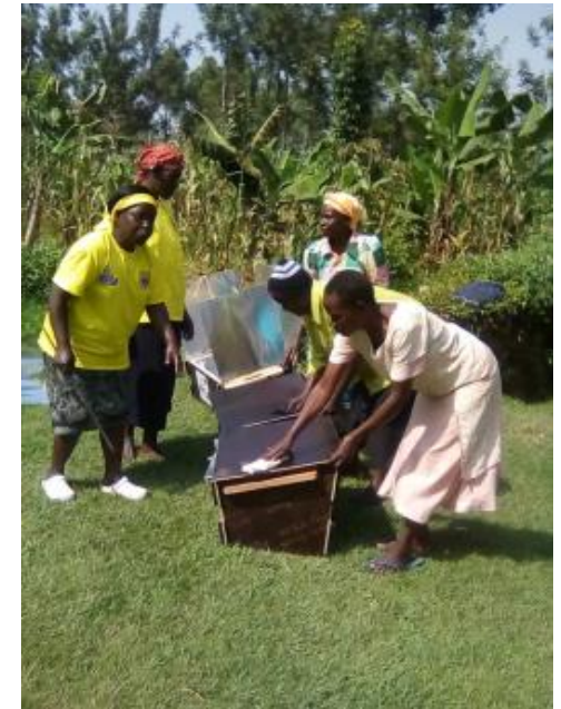
Trainees in the village