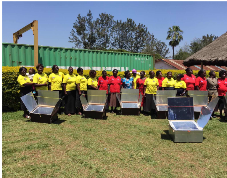
Area trainers in a class